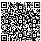
How to guide

Check out OSPRI's website for more information about your record obligations.